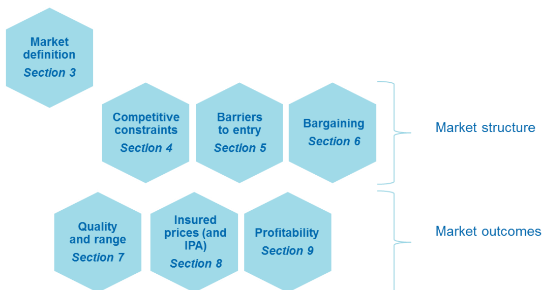
Figure 4.1: The key building blocks of our competitive assessment of private hospital operators in central London

4.6 We have applied the same analytical framework to the competitive assessment of private hospital operators in central London in this remittal. The results of our analysis of product and geographic markets, defined in Section 3, provided a framework for the assessment of competitive constraints, in terms of the set of medical treatments and relevant (private) healthcare providers on which our assessment has largely focused. We then went on to reassess the market features characteristic of privately-funded healthcare services in central London based on an analysis of barriers to entry and expansion, local competitive constraints and the framework for bargaining (between hospital operators and PMIs). Finally, we reconsidered market outcomes for privately-funded healthcare services in central London, namely insured prices (including our revised empirical analysis of insured prices), non-price outcomes (quality and range) and profitability.