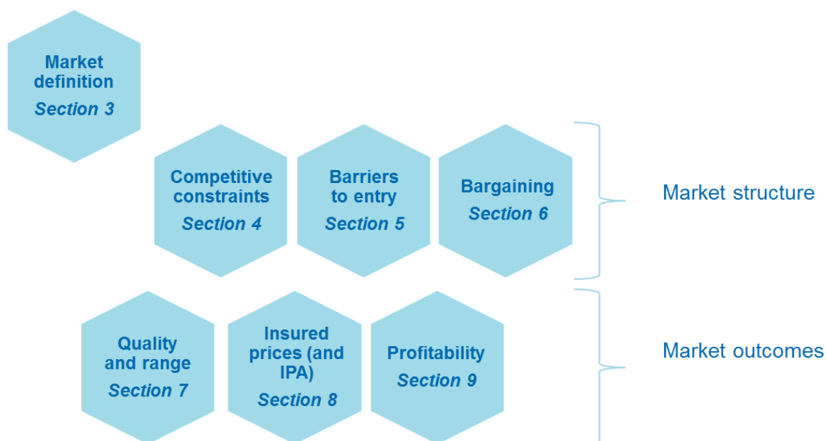
Figure 1: The specific issues that we considered as part of our competitive assessment of privately-funded healthcare services in central London