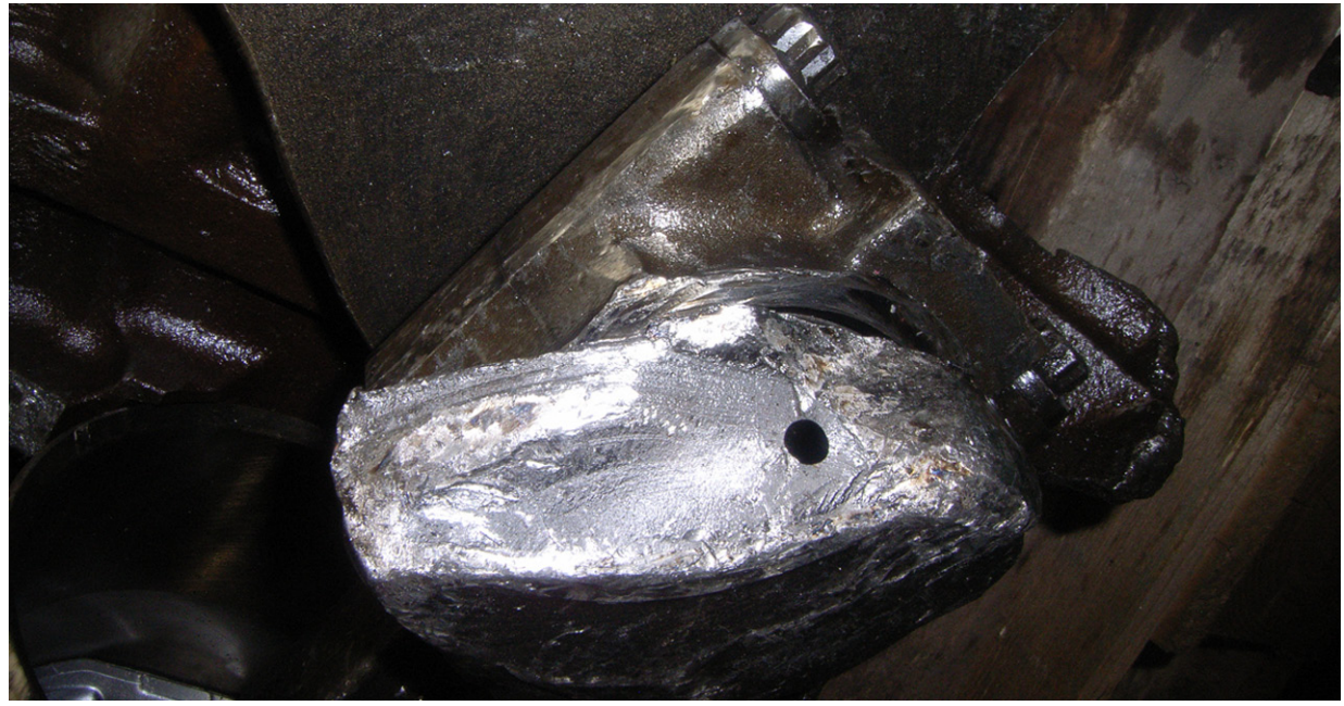
Figure 3: Crankshaft fracture face

5 The engine parts were recovered and taken to the engine overhauler's workshops for supervised examination and dismantling. The bearings and other internal engine parts were found to be well lubricated and there were no signs of overheating or seizure. The engine crankshaft had broken between the big end bearing of the 6<sup>th</sup> cylinder and the main bearing in the engine casing at the flywheel end. This break exhibited 'beach' marks characteristic of a fatigue failure (Figure 3). The torque load on the crankshaft of an engine on full power is at its maximum between the last cylinder and the flywheel, the location of the fracture.