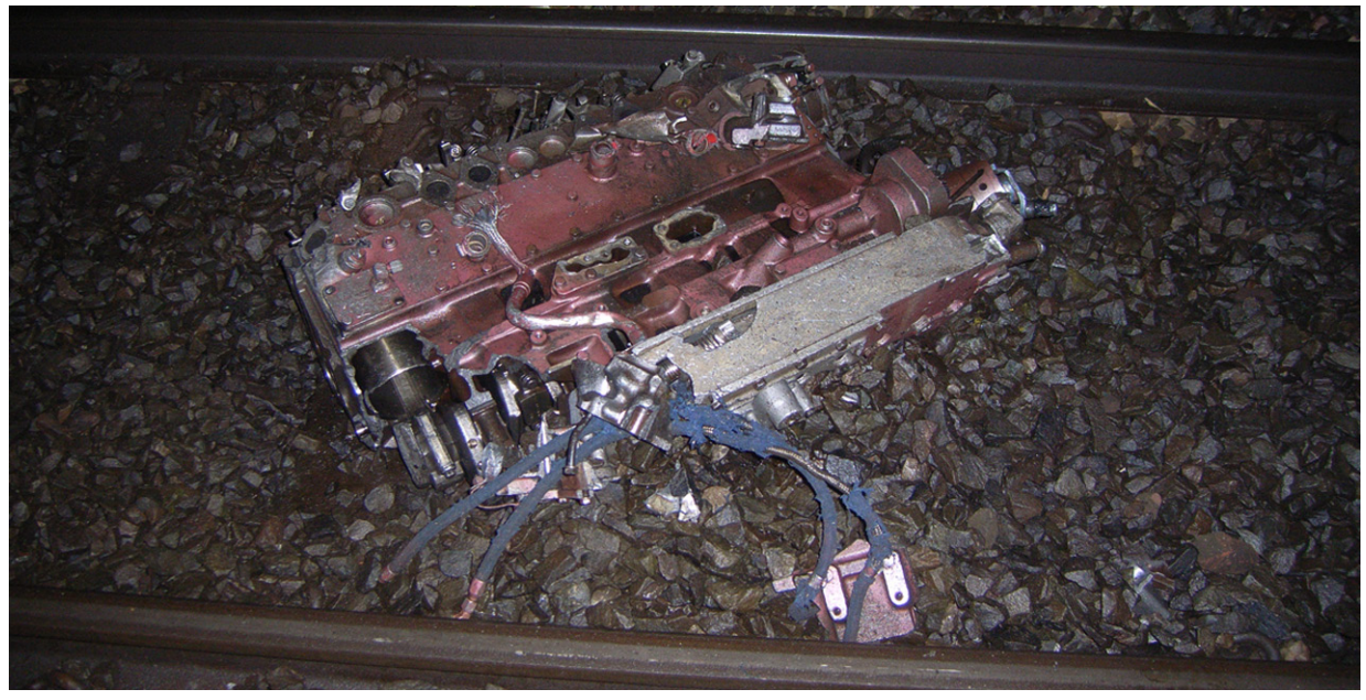
Figure 1: Detached engine

3 The rear coach of the train suffered extensive damage to underfloor equipment and the diesel fuel in its tank was lost to the environment. The track was damaged over a distance of 330 m, causing the railway to be closed to traffic for 22 hours while repairs were made. Three passengers and one member of the train crew sustained minor injuries.