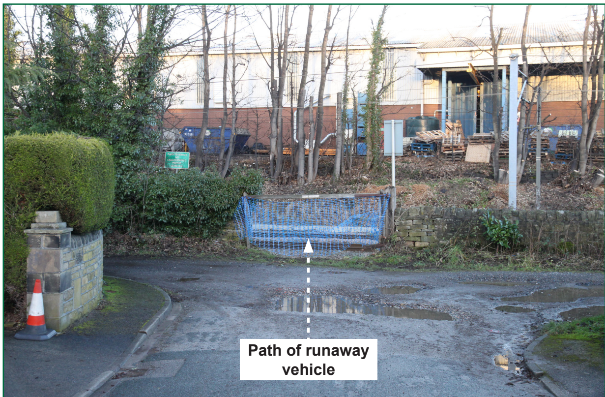
Figure 6: The location of the vehicle incursion incident from Healey Avenue, Bingley, on 11 November 2013