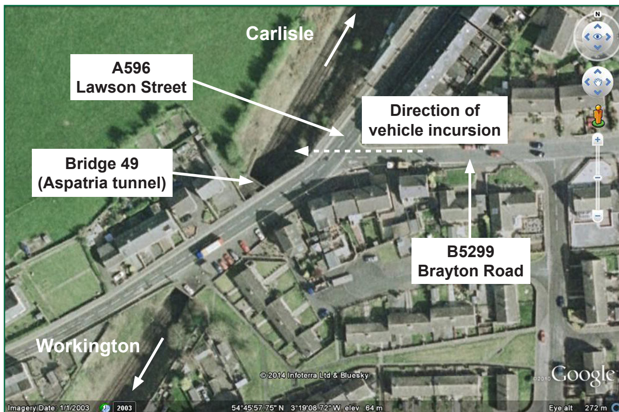
Figure 3: Site location, Aspatia