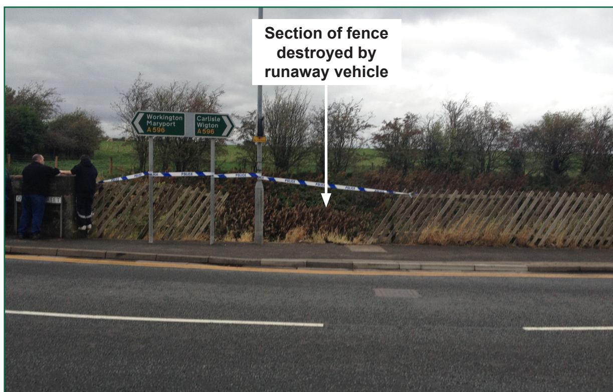
Figure 5a: The consequences of the runaway from the B5299/Brayton Road