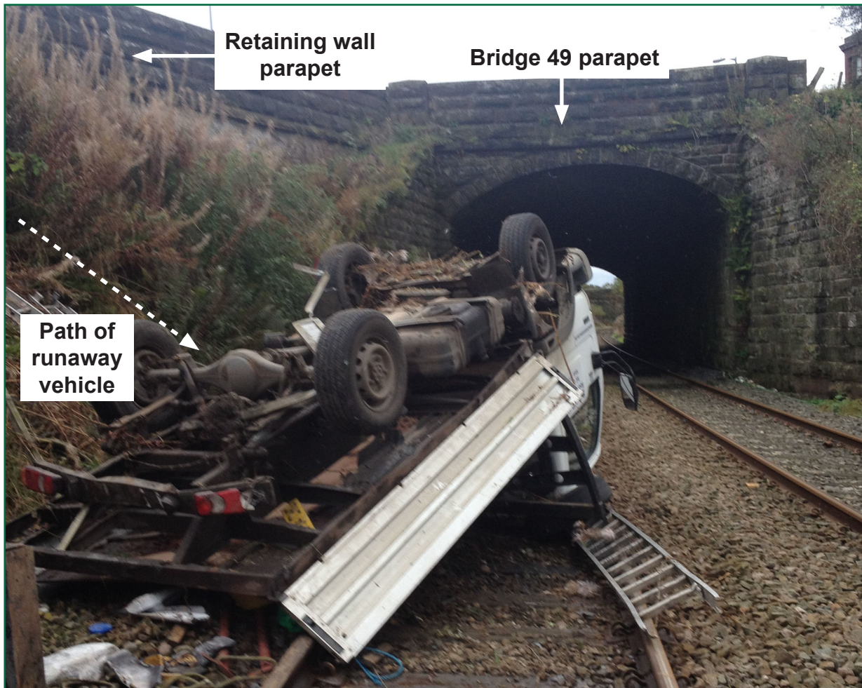
Figure 5b: The consequences of the runaway from the B5299/Brayton Road