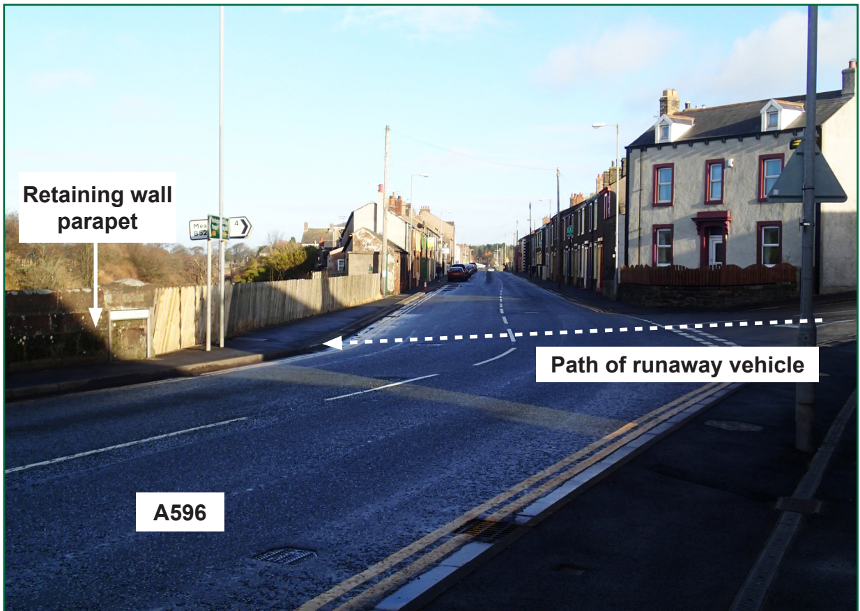
Figure 4b: The wooden fenced boundary opposite the A596/B5299 junction