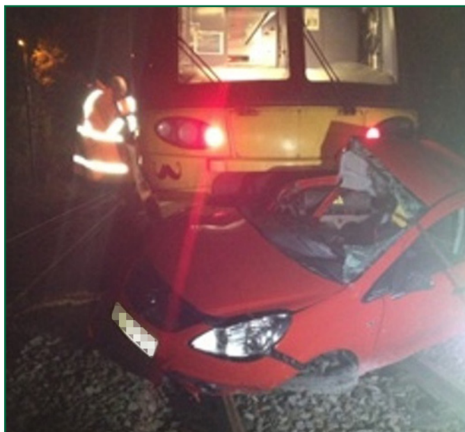
Figure 7: The accident at Bingley following the runaway from Healey Avenue onto the railway