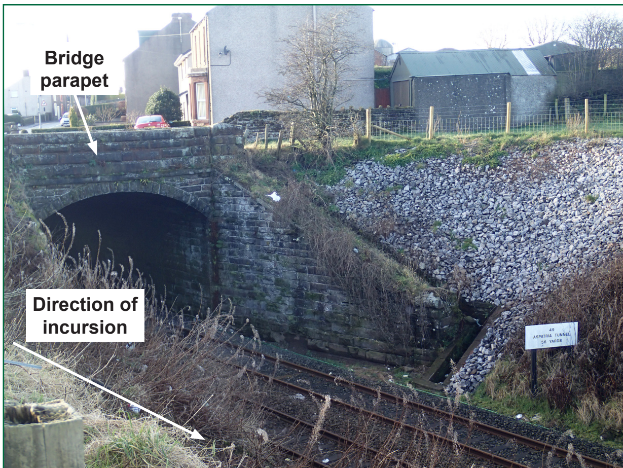
Figure 2: Bridge 49 at Aspatria