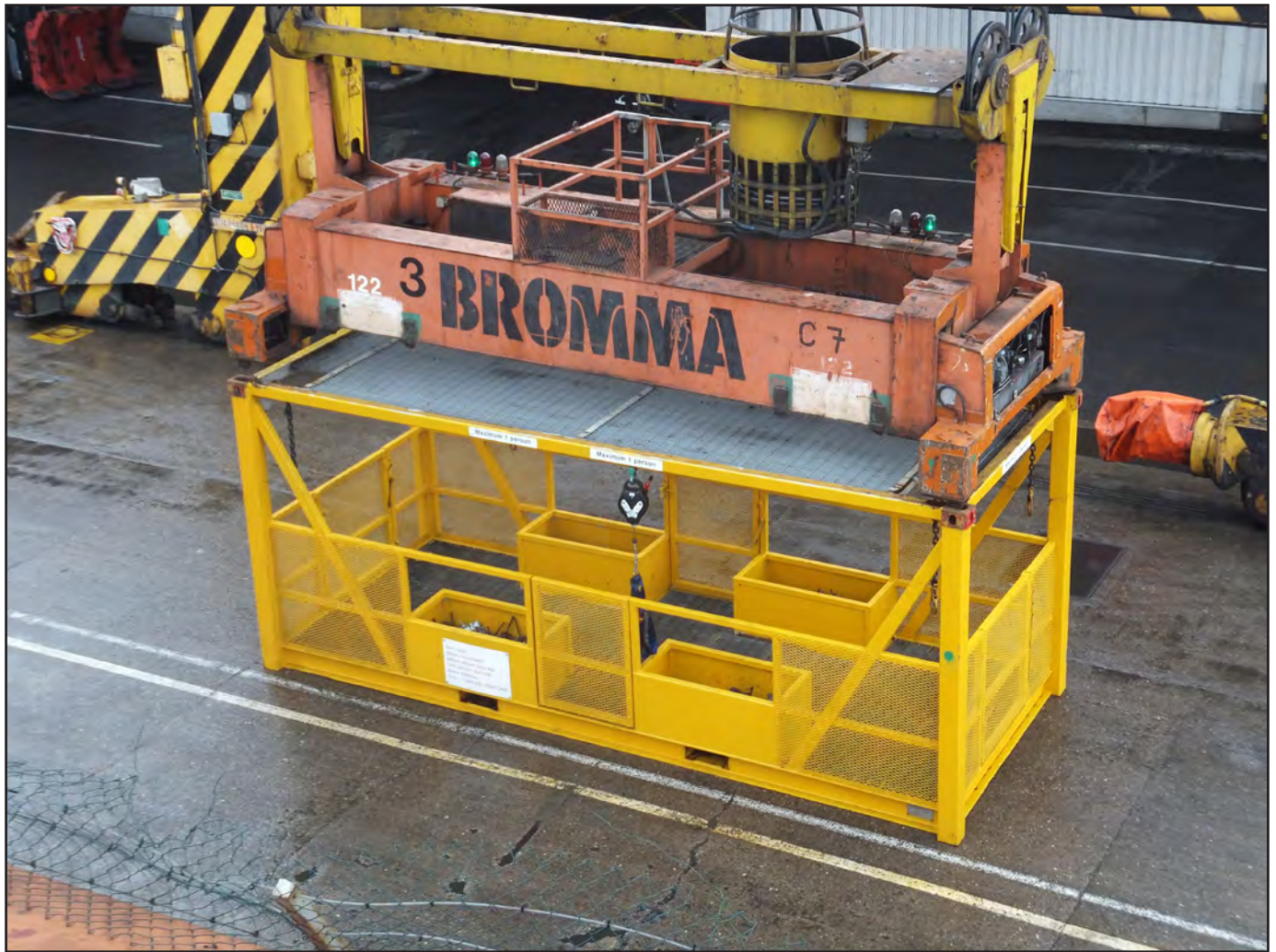
Figure 3: Man-basket