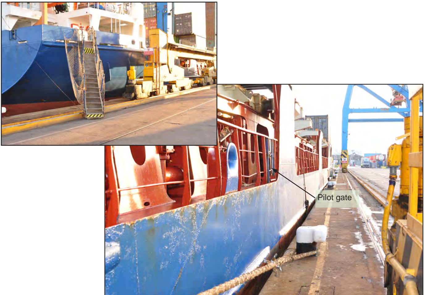
Figure 1: Dette G alongside Hull container terminal