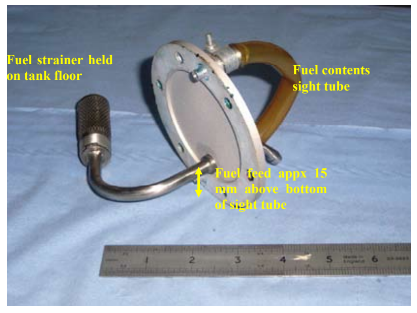
Fuel off-take tube