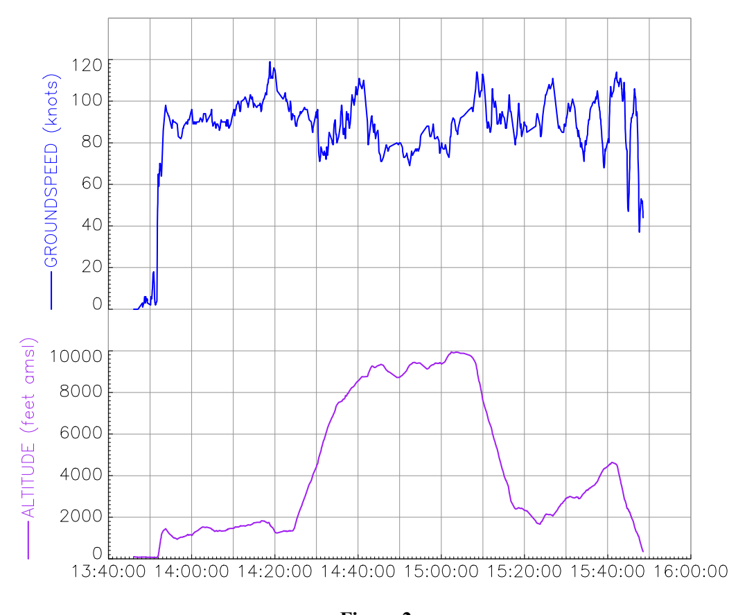
Figure 2 The aircraft's altitude and groundspeed

The final descent was at a rate of approximately 900 ft/min, reducing to 600 ft/min as the aircraft flew a descending turn, clockwise, through 270° (see Figure 3) The aircraft continued descending at about this rate until the final recorded GPS position, which placed the aircraft at 340 ft amsl (110 ft agl), close to the accident site.