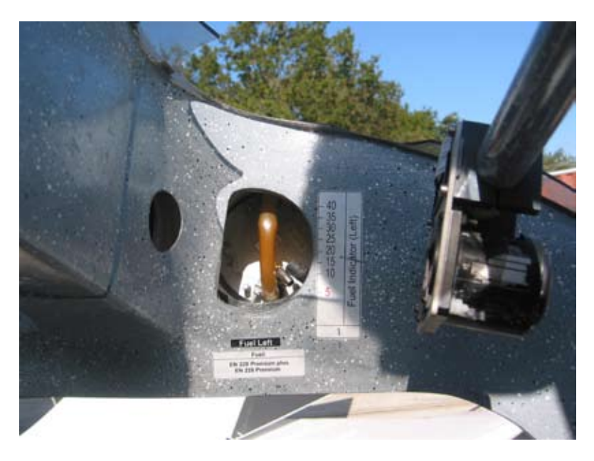
View of left tank fuel contents sight tube and gauge Figure 4

Views of fuel tank off-take, fuel contents sight tube and gauge