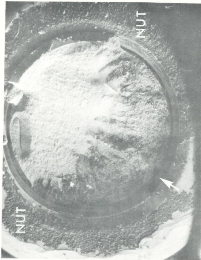
Aft (threaded in nut) Segment