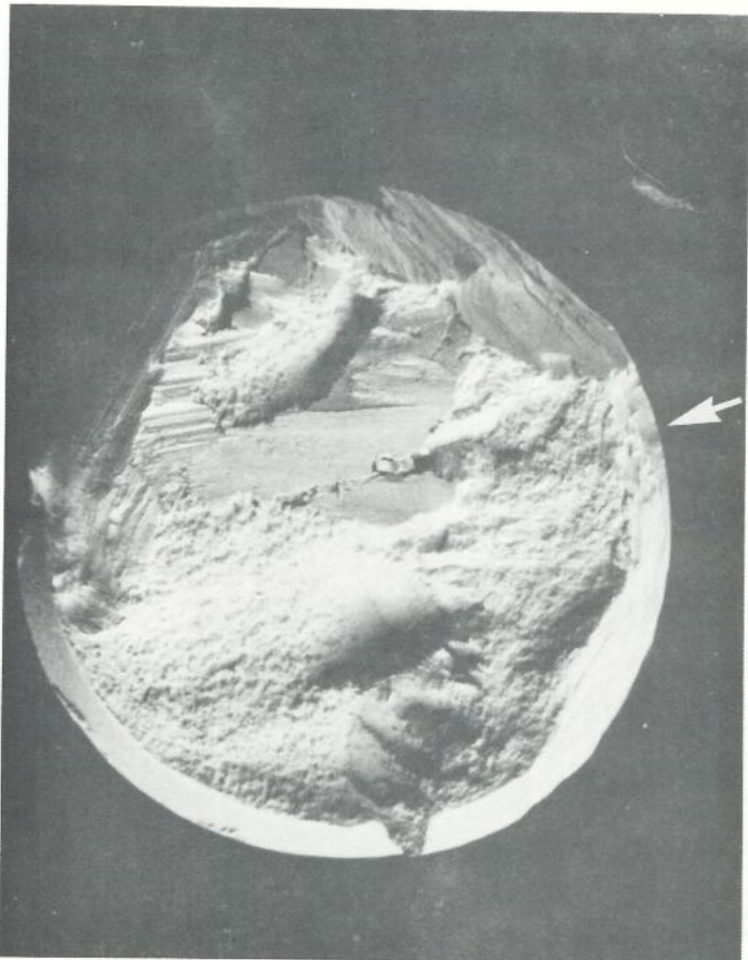
Forward (long) Segment

Mating fracture surfaces of the Turbine Tie Bolt after cleaning, with the origin indicated by arrows.