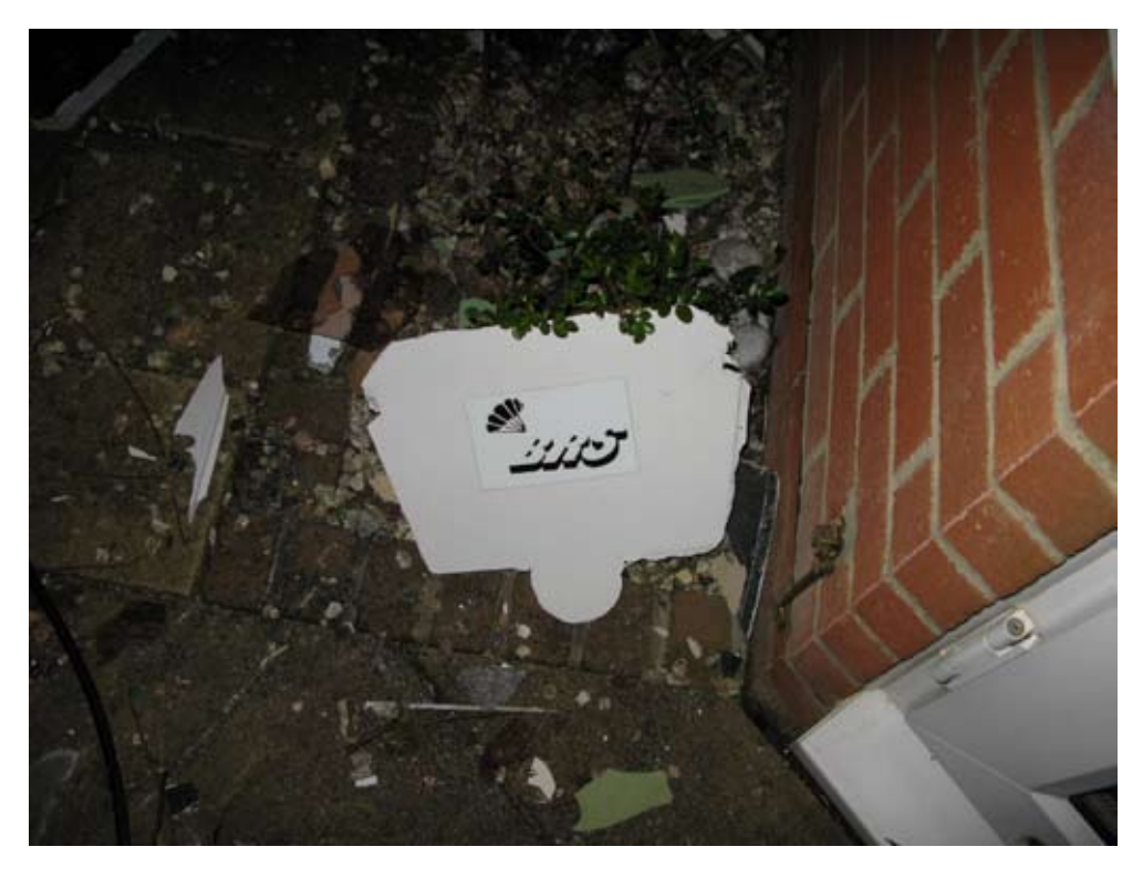
Figure 3. Neither contained any explicit reference to pyrotechnic or projectile hazards. The BRS logo was also displayed on the top surface of the parachute within the compartment, Figure 3.

compartment, bearing the legend, 'DANGER FUSEE DEXTRACTION PARACHUTE' (DANGER ROCKET EXTRACTION PARACHUTE), with an arrow pointing towards the parachute compartment,